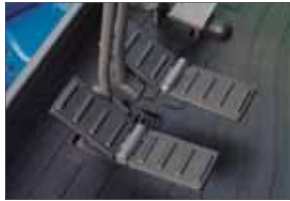
Large Traction pedals

The accumulator is installed as to depressurize auxiliary line and lower attachments in emergency.