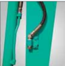
Auxiliary Hydraulic Piping