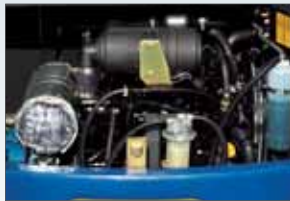
Larger engine adopted.

The engine cover, right side cover all can easily be fully opened.